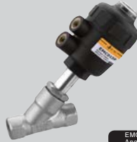
EMCP Plastic Actuator Series Angle Valve