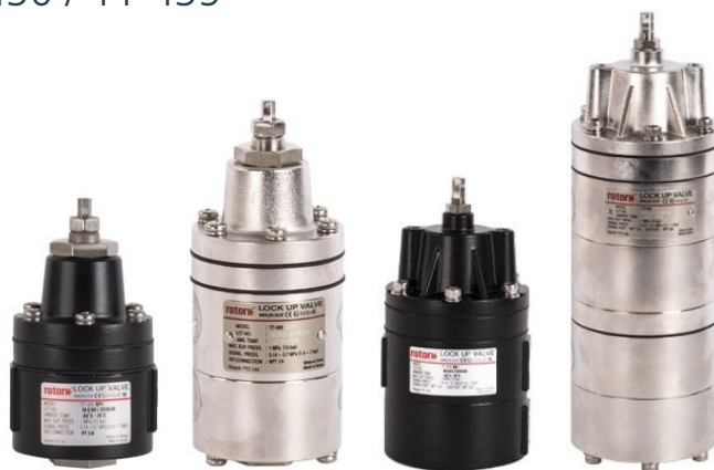
YT-400S YT-405D YT-430S YT-435D