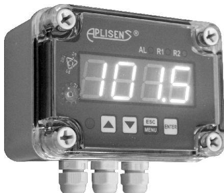
M12x1,5 cable gland