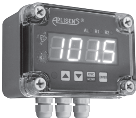
M12x1,5 cable gland