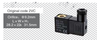
Original code 2VC Orifice: \phi 9,2mm L x W x H: 28,2 x 22 x 31,5mm