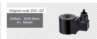
Original code ZSC-2D Orifice: \phi 20,3mm H: 50mm