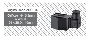
Original code ZSC-1D Orifice: \phi 16,3mm L x W x H: 54 x 38,5 x 40mm