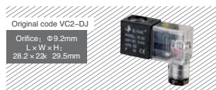
Original code VC2-DJ Orifice: \phi 9,2mm L x W x H: 28,2 x 22 x 29,5mm